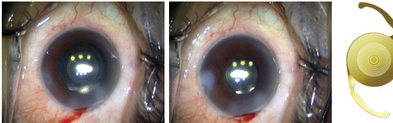
Figure 1-2: The view of AcrySof® ReSTOR implanted in the bag before and after the myotic application into the anterior chamber during the operation.

Postoperative mean PSF values were 0.055±0.066 (range 0.009-0.219) and 0.077±0.121 (range 0.002-0.322) in Group 1 and 2 respectively. The difference between the two groups was statistically insignificant (p>0.05) (Figure 1).