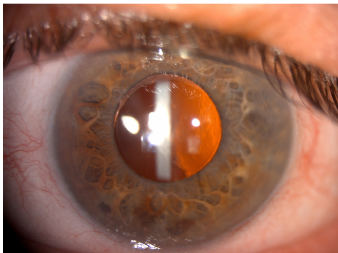
Figure 2: Measurement of the vertical diameter of the anterior capsulorhexis using a slit lamp biomicroscope.

of the capsulorhexis were measured horizontally and vertically using a slit lamp biomicroscope (Figure 1 and 2). The Alpine method was used for the calculation of surgically induced astigmatism. ( http://www.drpeyman.ir/Ophthalmology_Calculator.htm ).