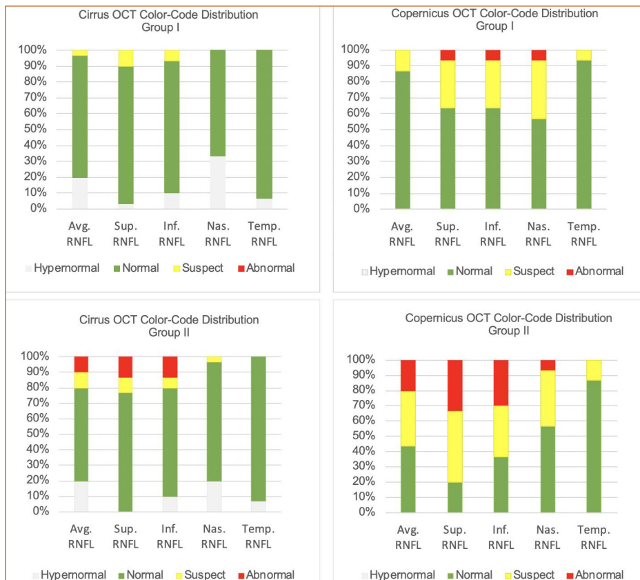
Figure 2: Distribution of color-codes created by Cirrus and Copernicus optical coherence tomographies in patients with glaucoma suspect (Group I) and early glaucoma (Group II)

RNFL: Retinal nerve fiber layer; OCT: Optical coherence tomography